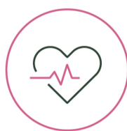
HEALTH AND WELL-BEING