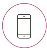
DIGITALIZATION AND THE CLOUD