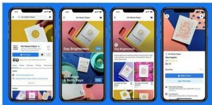
Facebook Shops will allow sellers to create digital storefronts on Facebook or Instagram

"Facebook Shops" will allow sellers to create digital storefronts on Facebook or Instagram.